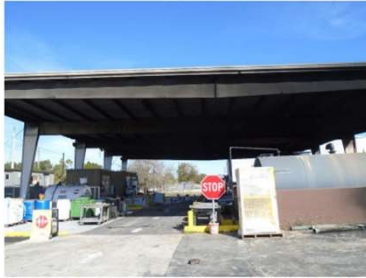
Photo 1. South entrance of canopy-covered receiving and collection area. View to north.

APPENDIX A PHOTO LOG ORANGE COUNTY SOLID WASTE DIVISION HHW FACILITY, 5901 YOUNG PINE ROAD, ORLANDO, FLORIDA