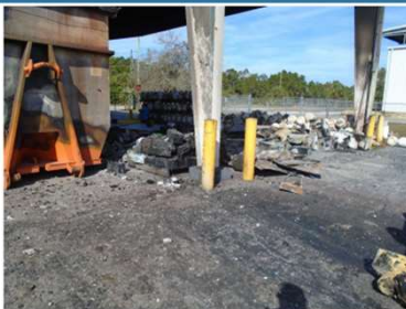
Photo 5. Battery, electronics, and propane collection area. View to northwest.

APPENDIX A PHOTO LOG ORANGE COUNTY SOLID WASTE DIVISION HHW FACILITY, 5901 YOUNG PINE ROAD, ORLANDO, FLORIDA