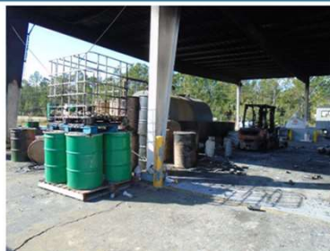
Photo 7. Oxidizers, pesticides, propane, acids, and caustics collection area. View to west.

APPENDIX A PHOTO LOG ORANGE COUNTY SOLID WASTE DIVISION HHW FACILITY, 5901 YOUNG PINE ROAD, ORLANDO, FLORIDA