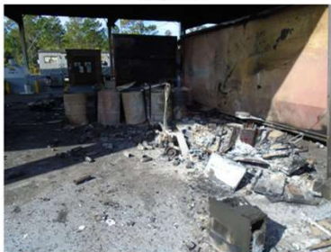
Photo 6. Electronics, aerosols, and flammable liquids collection area. View to west.