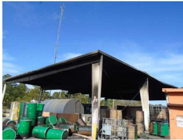
Photo 8. New drums, 6000 gal stormwater tank, pallet and empty drums collection area. View to northwest.