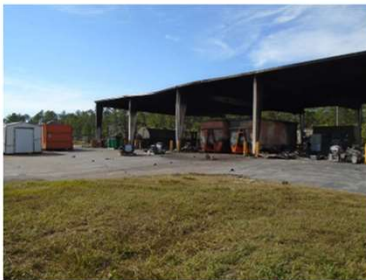
Photo 4. East side of canopy-covered waste collection area. View to southwest.