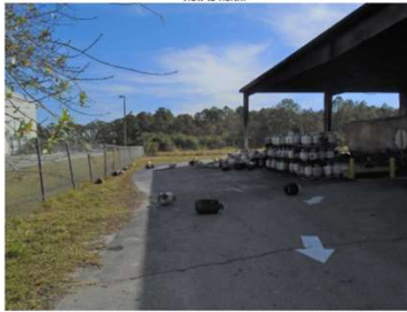
Photo 2. North exit of canopy-covered receiving and collection area. View to east.