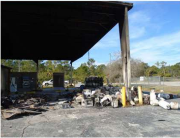
Photo 3. Battery, electronics, and propane tank (empties and partials) collection area. View to west.

APPENDIX A PHOTO LOG ORANGE COUNTY SOLID WASTE DIVISION HHW FACILITY, 5901 YOUNG PINE ROAD, ORLANDO, FLORIDA